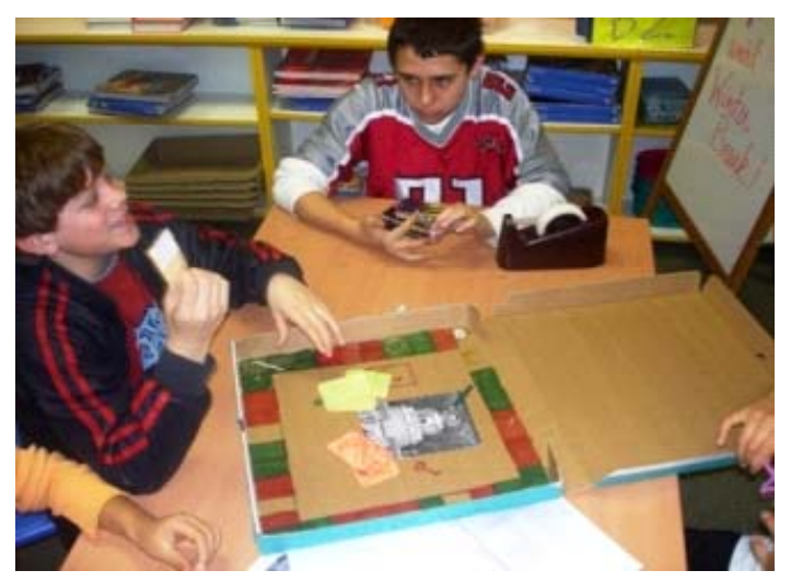
The game project is being field tested