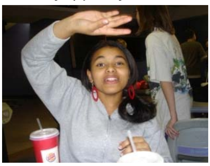
Reward day student celebrates