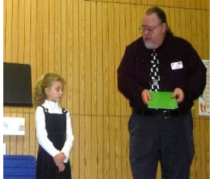
Card tricks anyone?