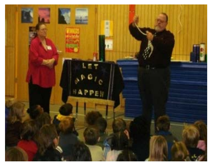
What is a magician without the old standard rope tricks?