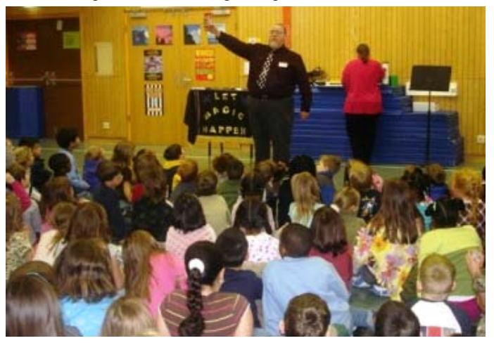
The crowd is totally engaged