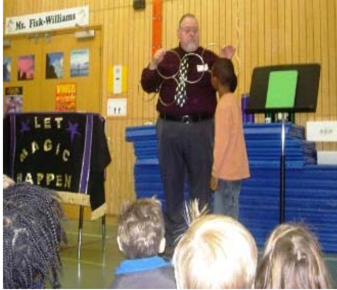
The magician and his magic rings thrill the audience