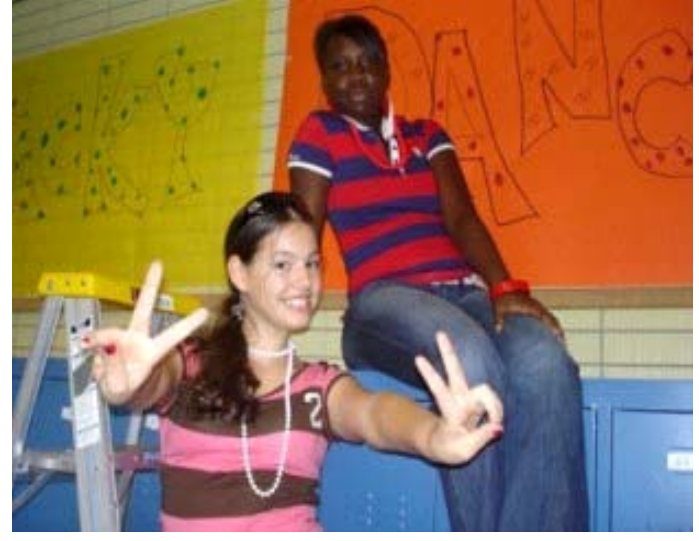
Student Council prepares for a school dance