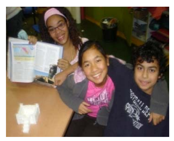
And their creation looks just like the original